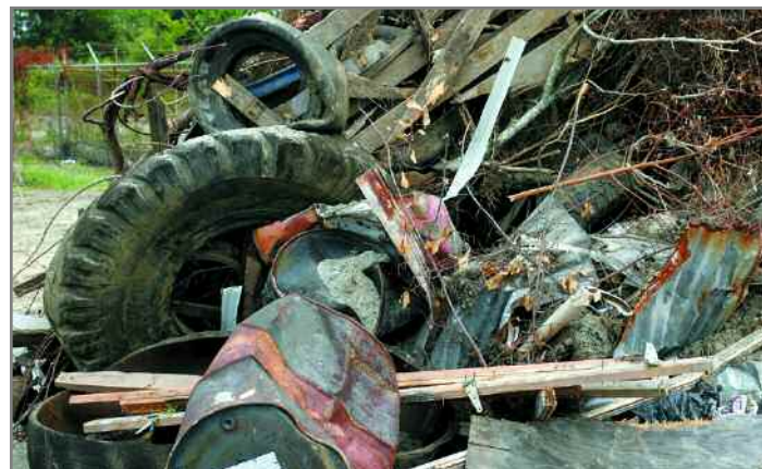
With each issue of the Budget Response we hope to receive suggestions about regional areas that could be beautified with Budget Maintenance's maintenance expertise. You tell us where it's at and we'll do the rest!

An abandoned lot in Pottstown ; a litter-strewn median in King of Prussia ; a hillside full of garbage in Reading , community blight exists everywhere Budget does business and we're asking Budget customers to CHALLENGE us to help.