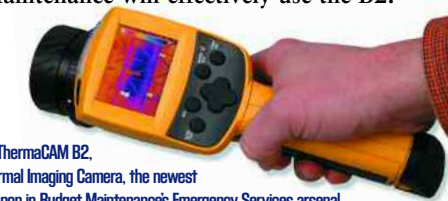
Flir ThermaCAM B2. Thermal Imaging Camera, the newest weapon in Budget Maintenance's Emergency Services arsenal.

crisp thermal imaging and in-field JPEG thermal image storage – all at the push of a button. The B2 allows inspection findings to be reported easily as the camera interfaces with a computer and reporting software. Turn the page to learn how Budget Maintenance will effectively use the B2.